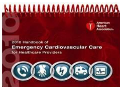
ACLS 2010 ECC Handbook

Florida Hospital Memorial Medical Center ACLS Course Syllabus 2011